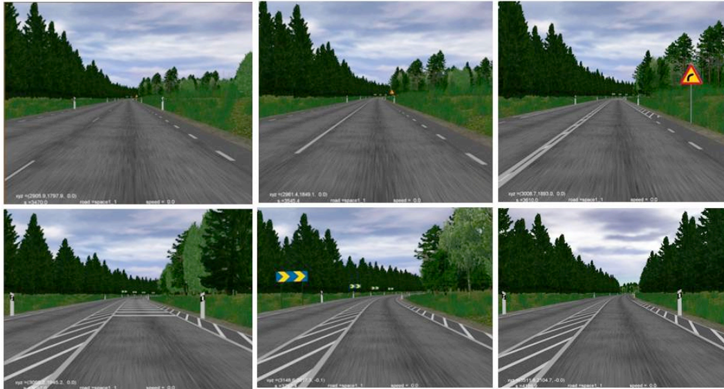
Figure 1. The drivers' view of the scenario at the different points in case of high treatment level.

The analysis of the effects on speed in average and at each point (v0 to v5) was done with Mixed Model ANOVA. Dependent variables were speed measurements in the different points along the curve (v0 to v5) and the average speed through the total curve (from point v0 to v5). The analyses were done both for absolute speeds and for the relative change in speed from starting point (v0). Independent variables were consistent/inconsistent group; curve (1-3), treatment level (1-3) and time on task, here called order (1-9). Subject was used as random and nested on group. In addition the most severe curve was analysed separately in order to compare the groups.