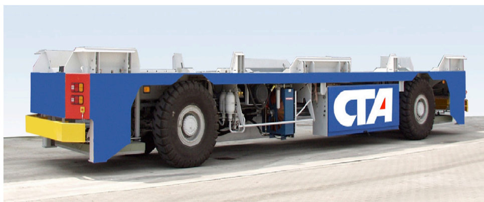
Figure 2. Automated Guided Vehicle AGV)