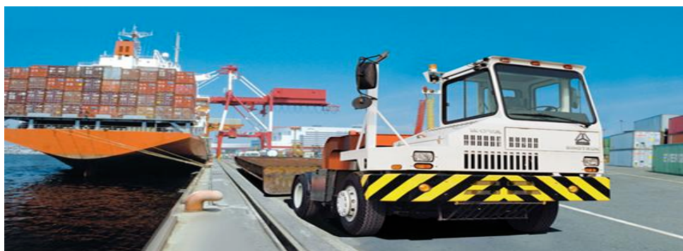
Figure 1. Shunter Vehicle